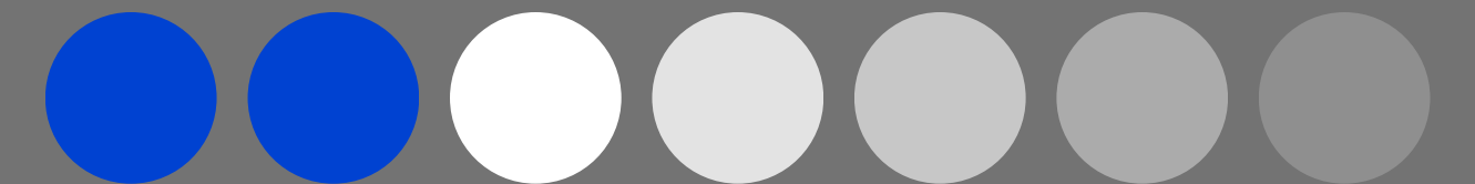
Evolving spheres patterns